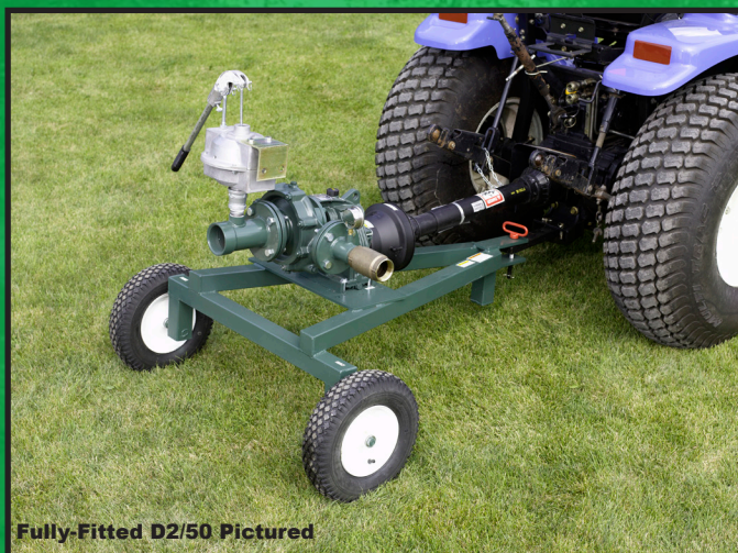
Fully-Fitted D2/50 Pictured