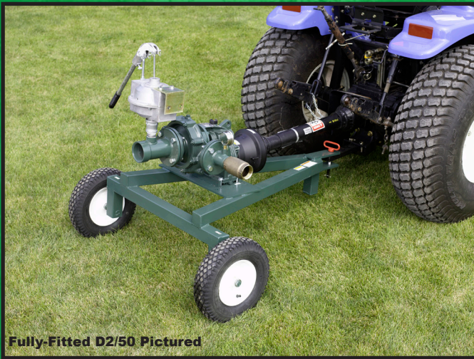
Fully-Fitted D2/50 Pictured