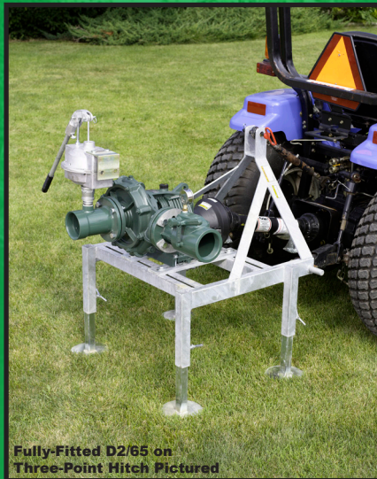
Fully-Fitted D2/65 on Three-Point Hitch Pictured