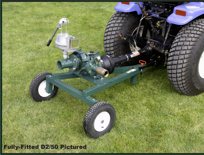
Fully-Fitted D2/50 Pictured